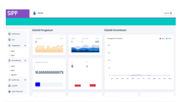
Figure 3. Dashboard Complaint and Examination Statistics